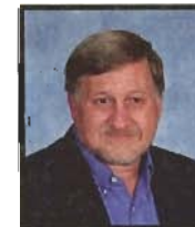
Scott Helton Juvenile Court