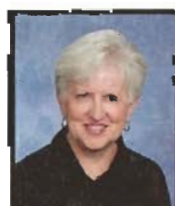
Kathryn Pagles Public Library