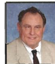
Mack Garner Public Defender