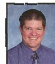
Mathew Widner Building Codes