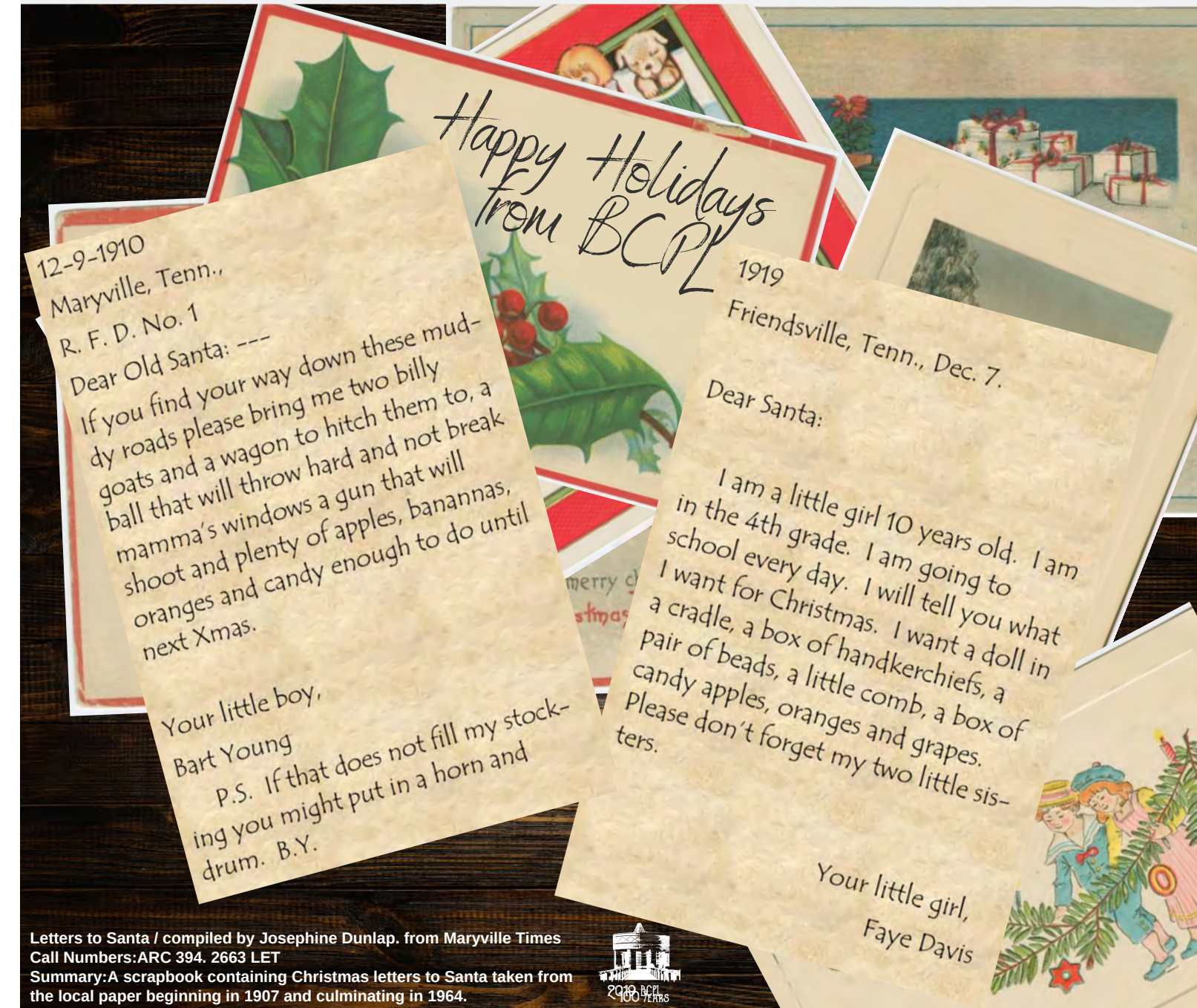
Letters to Santa / compiled by Josephine Dunlap, from Maryville Times Call Numbers:ARC 394, 2663 LET Summary:A scrapbook containing Christmas letters to Santa taken from the local paper beginning in 1907 and culminating in 1964.